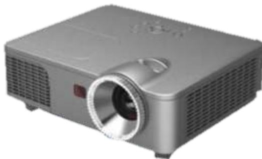
GD30S / GD30X

*Due to continuous development, the specifications may change without any prior notice