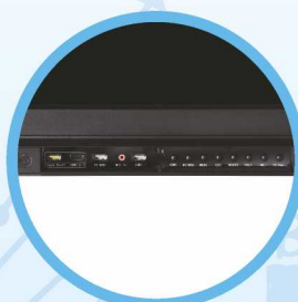
AV Input / Output