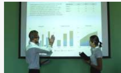
Meeting Rooms, Training Rooms