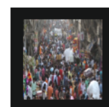
Crowded Public Places