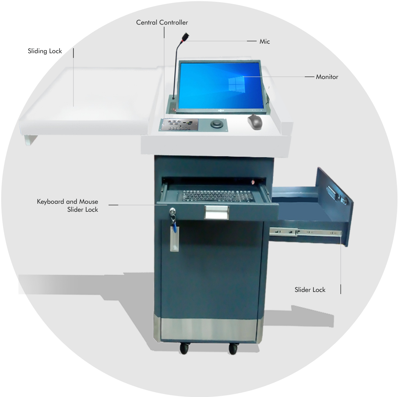
A Proficient, Powerful and All-In-One

This device helps to uplift the complete learning and teaching experience. It is a perfect amalgamation of interactivity, audio-video, computing, switching & controlling and a flawless device to deliver a impressive lecture or presentation. It allows the presenter to face and have a deeper connect with the audience. Comes with a flexibility of putting the customer organisation’s logo and information on the front side acrylic sheet.