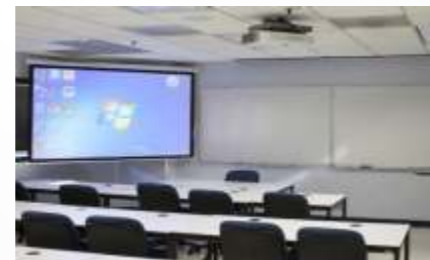
Huddle Rooms, Conference Rooms Seminar Halls