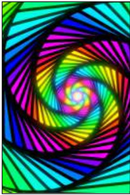
Globus Digital Projector