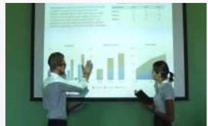
Meeting Rooms, Training Rooms