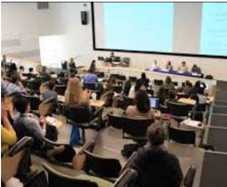
Conference Rooms/ Seminar Halls