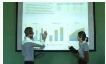
Meeting Rooms, Training Rooms