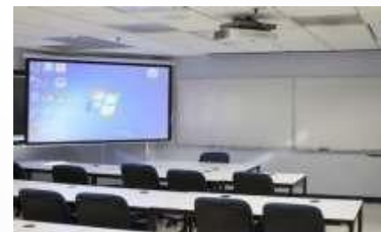
Huddle Rooms, Conference Rooms Seminar Halls