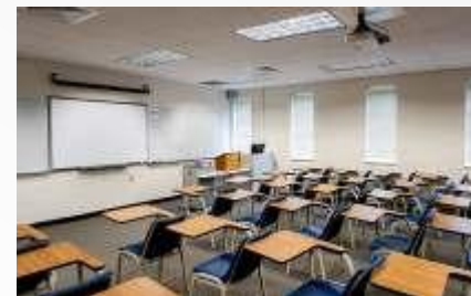
Schools, Colleges Universities