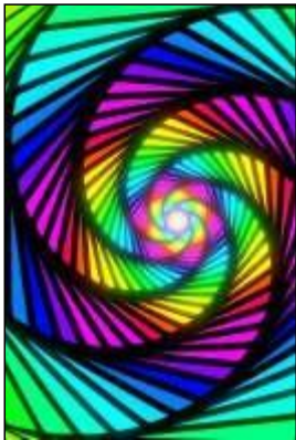
Globus Digital Projector