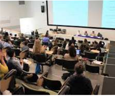
Conference Rooms/ Seminar Halls